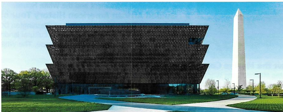
National Museum of African American History & Culture

Travel Protection: Travel Protection can be purchased at $51.00/person – Double Occupancy. If you wish to purchase Travel Protection, please send a separate check payable to PML Travel & Tours. Travel Protection should be purchased at the time of your initial deposit to ensure full benefits. Insurance premiums are non-refundable. Group cancellation policy applies. See the group leader for details. Fuel surcharges by all transportation companies may be assessed.